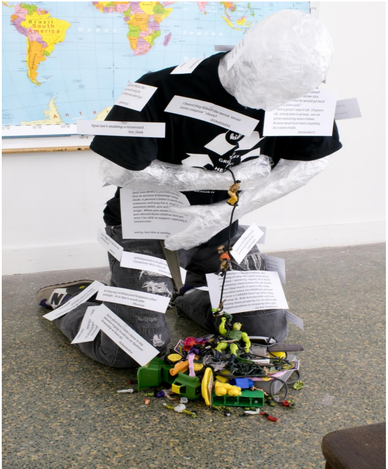
Nick Azzaro, Ypsilanti, MI. 'Sticks & Stones', Classroom installation.