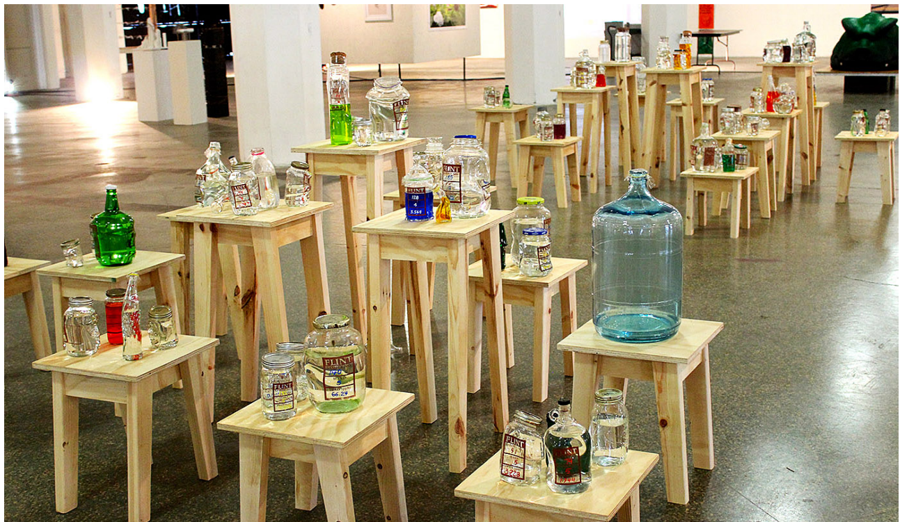
Mark Bleshenski, Plumbum (2016), installation view

displays recreates a collaborative installation originally done in Flint by Desiree Duell (Flint, MI). The piece, which jumps the bank of the window bay and spills out onto the main gallery floor, is comprised of dozens of disposable plastic water bottles – the woefully insufficient temporary measure provided en masse to Flint residents in lieu of a potable water system – outlining the form of a fallen child. The bottles on the floor inside, activated by LED lights, spell out “THIRST.” A series of photographs by Darryl Baird (Flint, MI) capture elements of the Flint water system: Eroded Manhole , Underground Sewer Line , Runoff Control Sewer , and others, each vignetted with a dreamy circular-crop more usually applied to glamor photos.